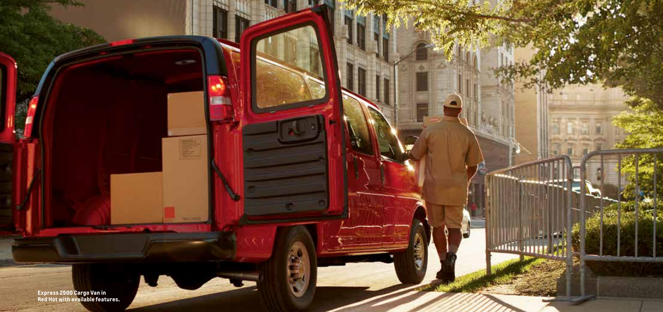
Express 2500 Cargo Van in Red Hot with available features.

Express Cargo Van offers a formidable lineup of Vortec powerplants, or choose the Duramax 6.6L Turbo-Diesel V8 – the most powerful diesel in this class.